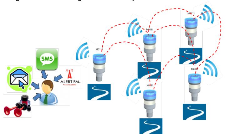
Figure 2: Architecture of the UbiFLOOD solution based on Ijinus sensors.

characteristics, the installation and the maintenance of the sensors represents a limited investment which allows redundancy in order to optimize the functionalities of the network. The sensors are connected to the communication network and can directly send information to the surrounding devices according to the defined protocol.