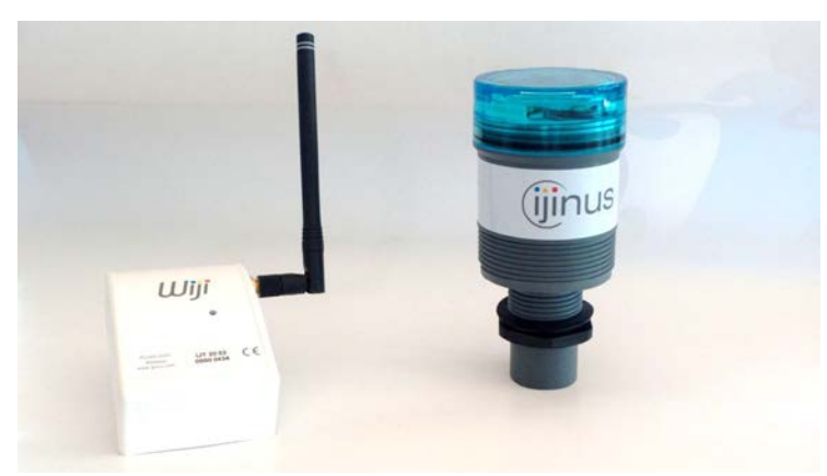
Figure 3: Ijinus ultra sonic sensor used as validation prototype.

In order to validate the concept, a prototype based on Ijinus communicating sensors [<u>http://www.ijinus.com</u>] wireless ultrasonic numerical level probe - has been developed and tested in laboratory, in Singapore. Some videos of the conducted experiments are presented on the UbiFLOOD website.